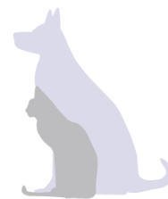
All models with Pet Immunity up to 25 Kg