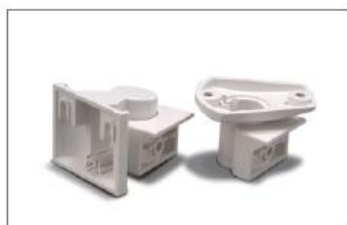
Installation bracket kit for Wall / Ceiling / Corner mounting