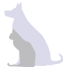
All models with Pet Immunity up to 25 Kg