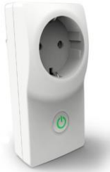
FW2-SPLG REMOTE CONTROLLED AC PLUG SOCKET P/N 7104700 REV. A (DZ)